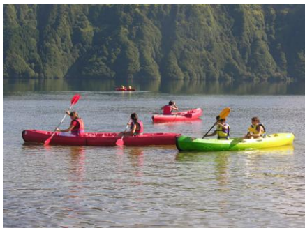
Sete Cidades lake