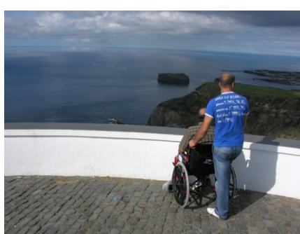
Pico do Escalvado viewpoint