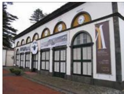
Azorean Emigration Museum

In this tour, we are going to the city of Ribeira Grande, in the north coast, to visit the Museum of the Azorean Emigrant. This Museum possesses a rich collection, donated by João Bosco da Mota Amaral, comprising gifts and keepsakes offered by Azorean emigrants and authorities of the countries where they settled, which adds to the interest of the museum, situated in the former fish Market of Ribeira Grande. Lunch in a local restaurant in Ribeira Grande. In the afternoon you'll visit one of the seven wonders of Portugal, Sete Cidades, in the west, is a crater with 12km perimeter where you can find two twin lakes, the Green Lake and the Blue Lake. You'll have the chance to do canoeing and feel the tranquility of the waters and the sweetness of the hydrangeas, which border the crater rim and contrast the steep sides of the crater, create a fascinating sight. Returning to the city of Ponta Delgada it will be possible to walk through the Portas do Mar where you'll have a nice view to the marina and accessible shops and restaurants.