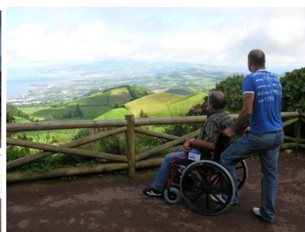
Pico do Carvão viewpoint