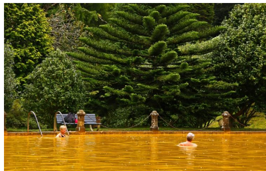
Terra Nostra Gardens – thermal pool

opportunity to have a guided tour through the unique tea factory in Europe that registered there beginning in 1750 due to the influence of a Chinese from Macau. This ancestral drink is extremely beneficent to health, even more than you might think.