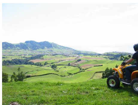
View to the village of Povoação