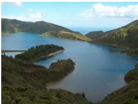
Lagoa do Fogo

The Azores archipelago is in the middle of the Atlantic Ocean, between Lisbon and New York, at latitude between 39° 56' and 36° 43' North and a longitude between 24° 46 'and 31° 16' West, almost a third of the way along the route between Europe and America.