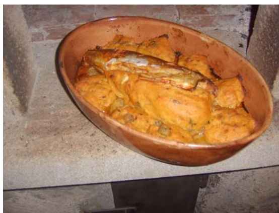
Meals in wooden oven – Casa da Fonte (minimum two persons)