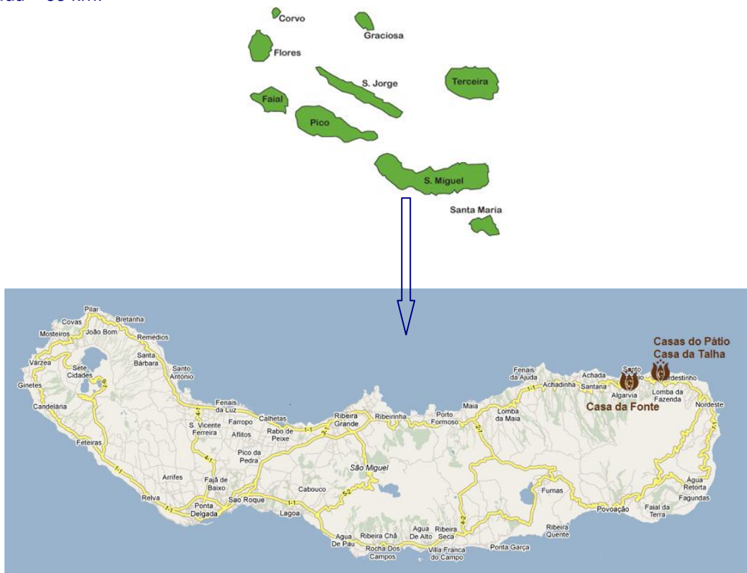
São Miguel island

From the Nordeste district to the main cities are: Ribeira Grande – 45 km; Vila Franca do Campo – 40 km and Ponta Delgada – 60 km.