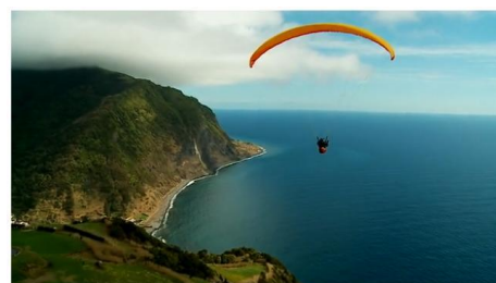
View of São Miguel

This activity is accessible for people with disabilities.