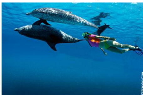
Dolphins on São Miguel Island

Entering the water provided with a mask and snorkel you'll get surrounded by blue water and as the dolphins joyfully glide by you can watch an amazing experience. Before the briefing to explain the cetacean's species measures on board, procedures some historical facts. On board a life vest. We provide wet suits