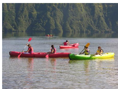
Sete Cidades lake