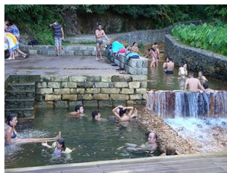
Poça da Beja – Thermal pool

In this full day program you'll have the opportunity to take a bath in Poça da Dona Beija, a small natural pools, know for its therapeutic properties, it's one of the best know "hotspots" in the parish of Furnas. Then is time to drive to Furnas where you'll be delighted to see one of our most important attractions - the lake of Furnas, as well as the halls where it's done the "Cozido das Furnas", in which meat and vegetables are stewed in the heat of the volcanic hearth for about 6 hours. It is time to taste the "Cozido das Furnas" in a local restaurant, as well as a local bread, pineapple and wine. After lunch, you'll make a visit to Vila Franca do Campo, the island's first capital in the 16 th century, and have beautiful view to the town on the shrine of Nossa Senhora da Paz belvedere. Returning the accommodation by the north coast, where you'll have the opportunity to see the fire lake and a beautiful view to all the 16km width of the island.