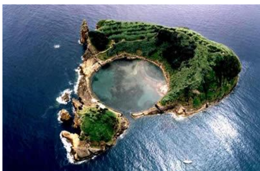
Vila Franca Islet