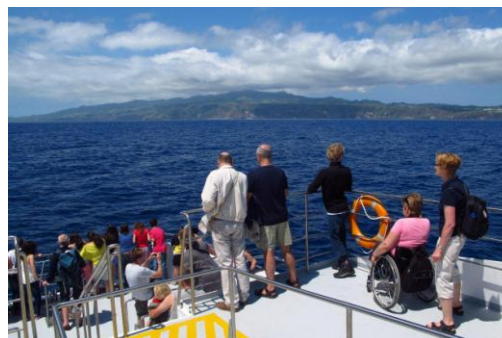
View to São Miguel Island

The boat is accessible for people in wheelchair.