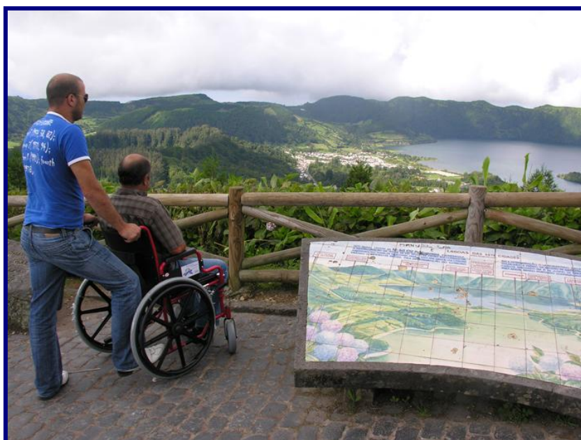
King's View –Sete Cidades –São Miguel