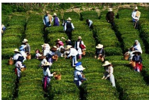
Tea harvest – São Miguel

In our full day tour you'll have the opportunity to discover the amazing gastronomy of the island, as well as our unique vegetation. Departing from the house towards the Tea Factory Gorreana, you will have the