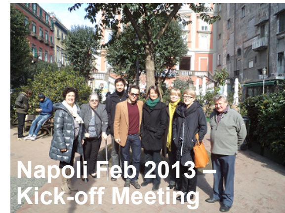
Napoli Feb 2013 – Kick-off Meeting