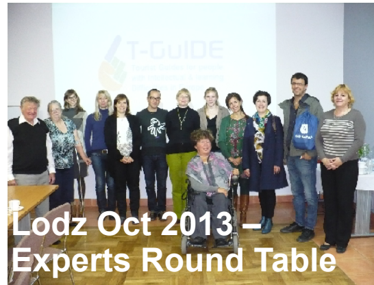
Lodz Oct 2013 – Experts Round Table