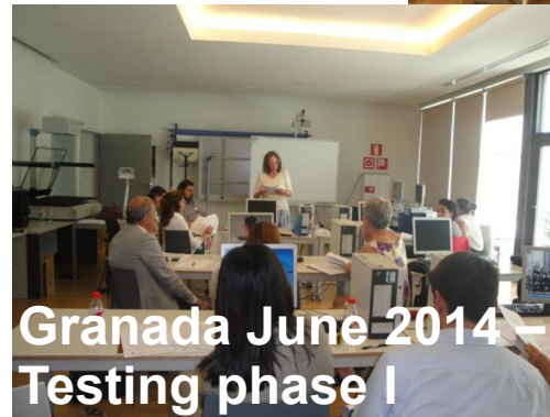
Granada June 2014 – Testing phase I