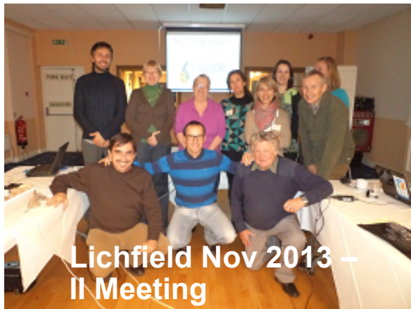
Lichfield Nov 2013 – II Meeting