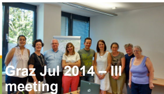
Graz Jul 2014 – III meeting