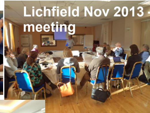
Lichfield Nov 2013 – meeting