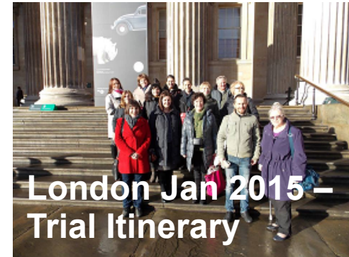
London Jan 2015 – Trial Itinerary