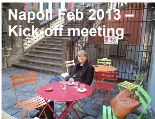
Napoli Feb 2013 – Kick-off meeting