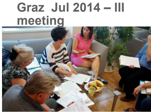
Graz Jul 2014 – III meeting