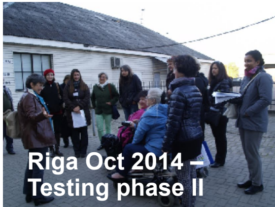
Riga Oct 2014 – Testing phase II