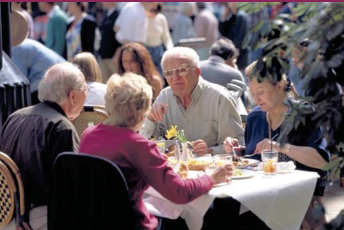
Enjoying life to the full in Britain. Dining out at Hays Galleria, Southwark, London.