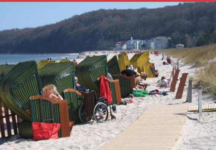
Tourism for All: Accessible beach at the Baltic Sea in Germany.