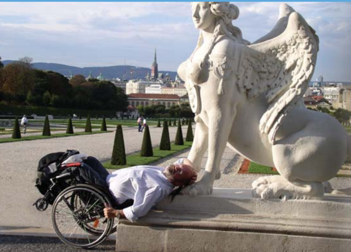
Relaxing on a warm day in Vienna.