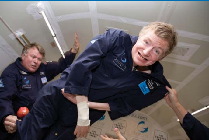
“Space, here I come.” Professor Stephen Hawking experiences weightlessness aboard a ZERO-G Weightless Flight.