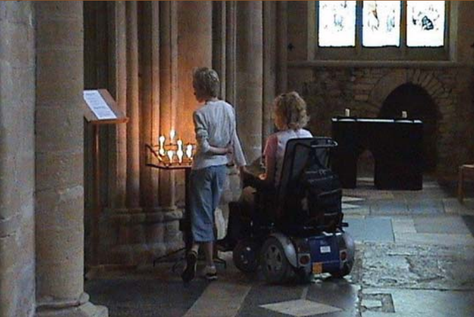
Prayer for All. Christ Church Oxford, UK.