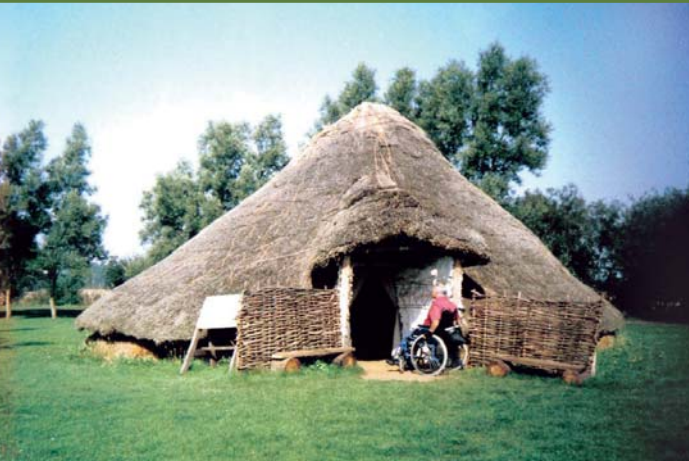
Flag Fen Bronze Age Site near Peterborough, Cambridgeshire, UK.