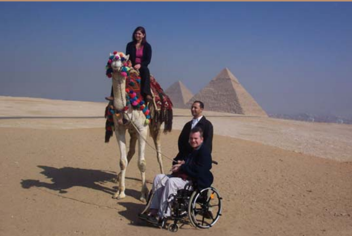
Even the pyramids are now accessible.