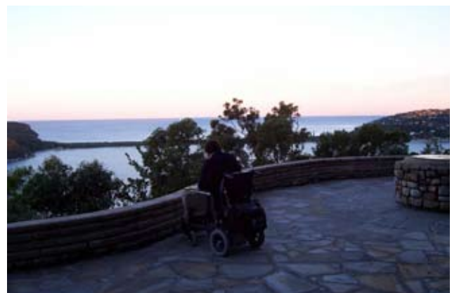
West Head Lookout, Sydney