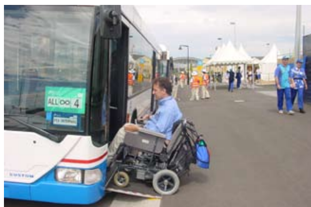
Accessible public transport at the Sydney Paralympics 2000