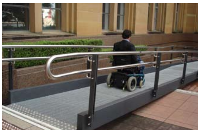
Sydney's Museum of Contemporary Art

This involves both participant observation and unobtrusive observation of tourist behaviour in public spaces to monitor how people engage with an area, space or place within urban precincts. The latter enabled the researchers to better understand how people with disabilities use their surroundings including products and services. This observation involved the researchers photographing people's behaviour such as the directions they take or are forced to take (as a consequence of constraints) and browsing behaviour. Various locations were randomly visited at different times. Inferences and judgment were made by the researchers regarding the observed behaviour of people following 'continuous pathways'.