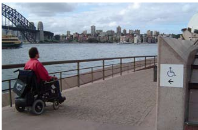
Signage and views of The Sydney Harbour Bridge & the Opera House

A combination of the disability advocacy organisations, Council of the Ageing and the online discussion list 'Ozadvocacy' would be used as a sampling frame.