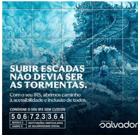
ASSOCIAÇÃO SALVADOR Climbing stairs shouldn't be such a torment