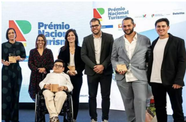
ACCESS LAB National Tourism Award Winner 2025