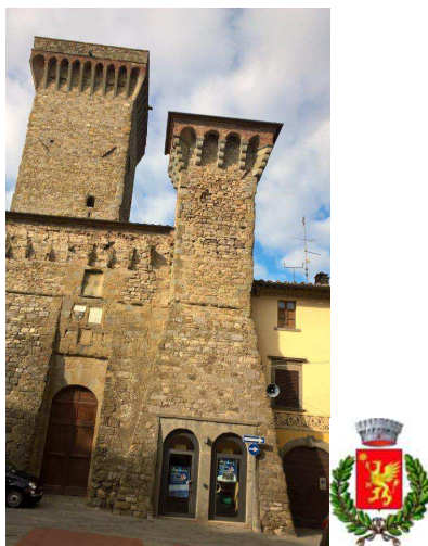
Rosini Theatre Lucignano

Conference, Lucignano (AR), 21-22 March 2016