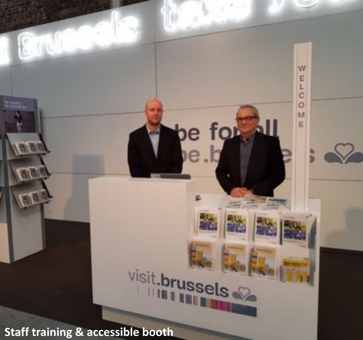
Staff training & accessible booth