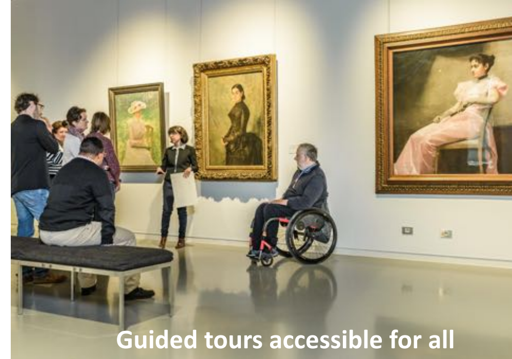
Guided tours accessible for all