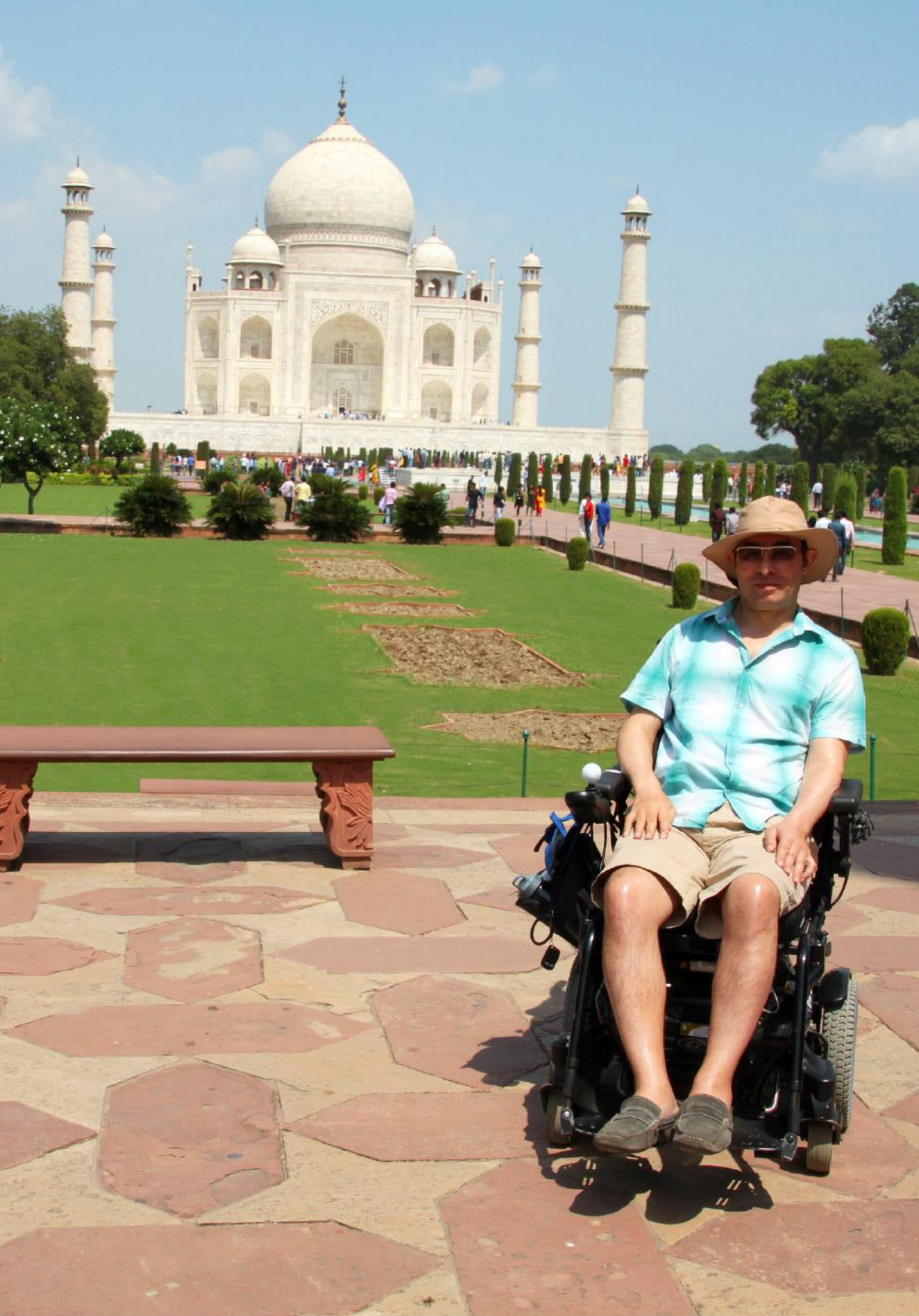
Taj Mahal, Agra