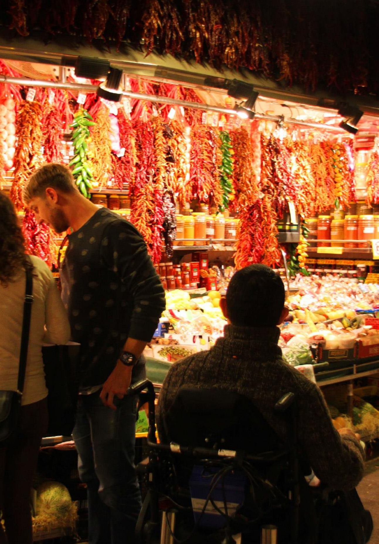
Mercat de Sant Josep de la Boqueria (La Boqueria), Barcelona