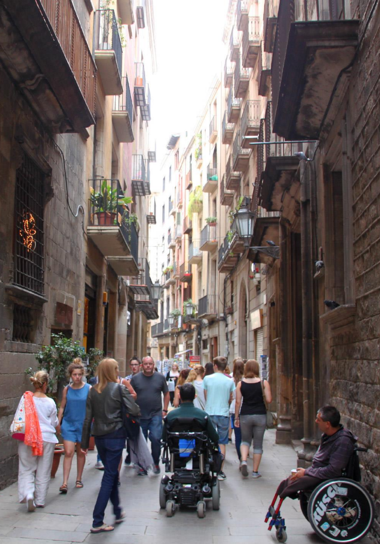
Gothic Quarter, Barcelona