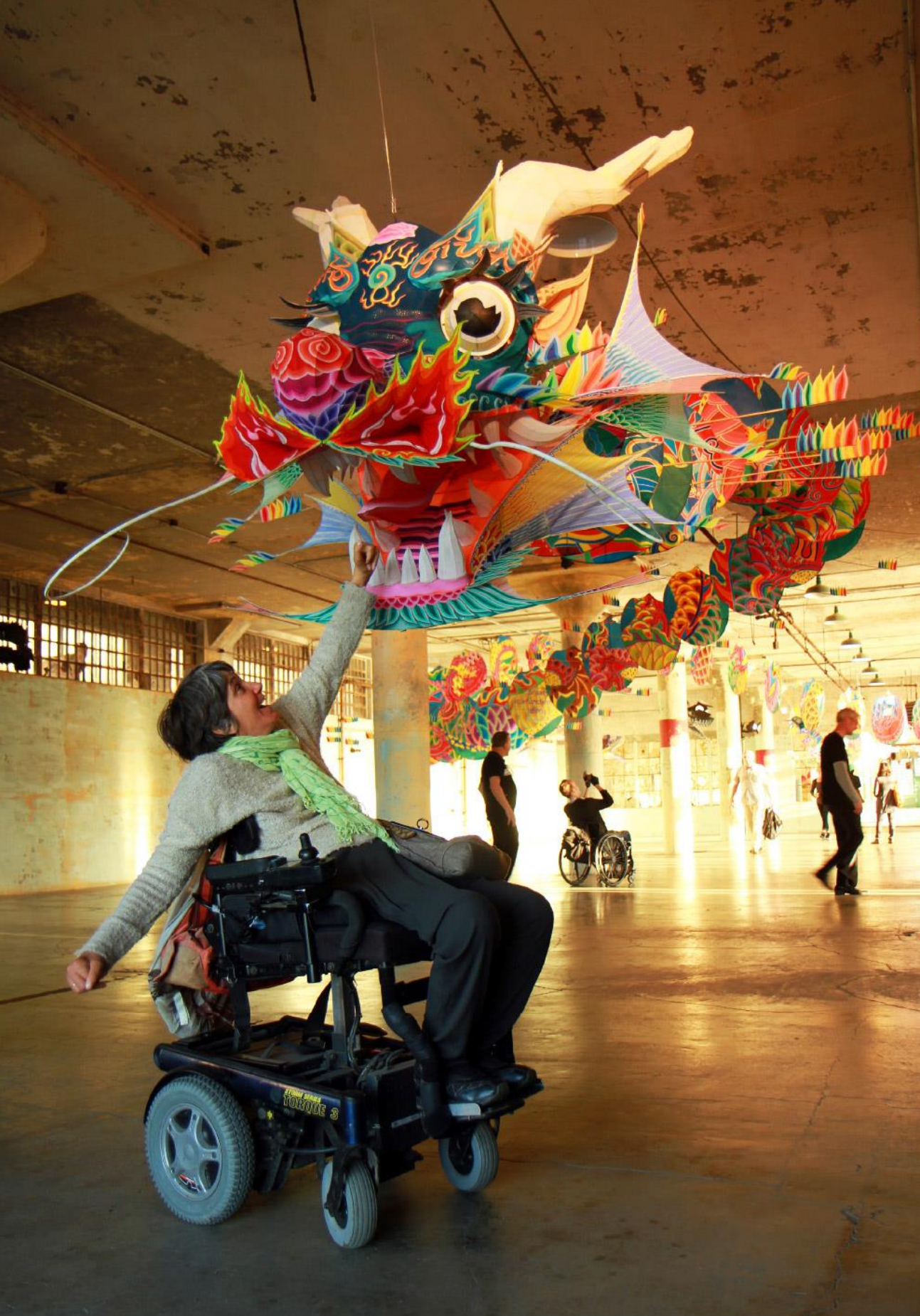
With Wind, Ai Weiwei on Alcatraz