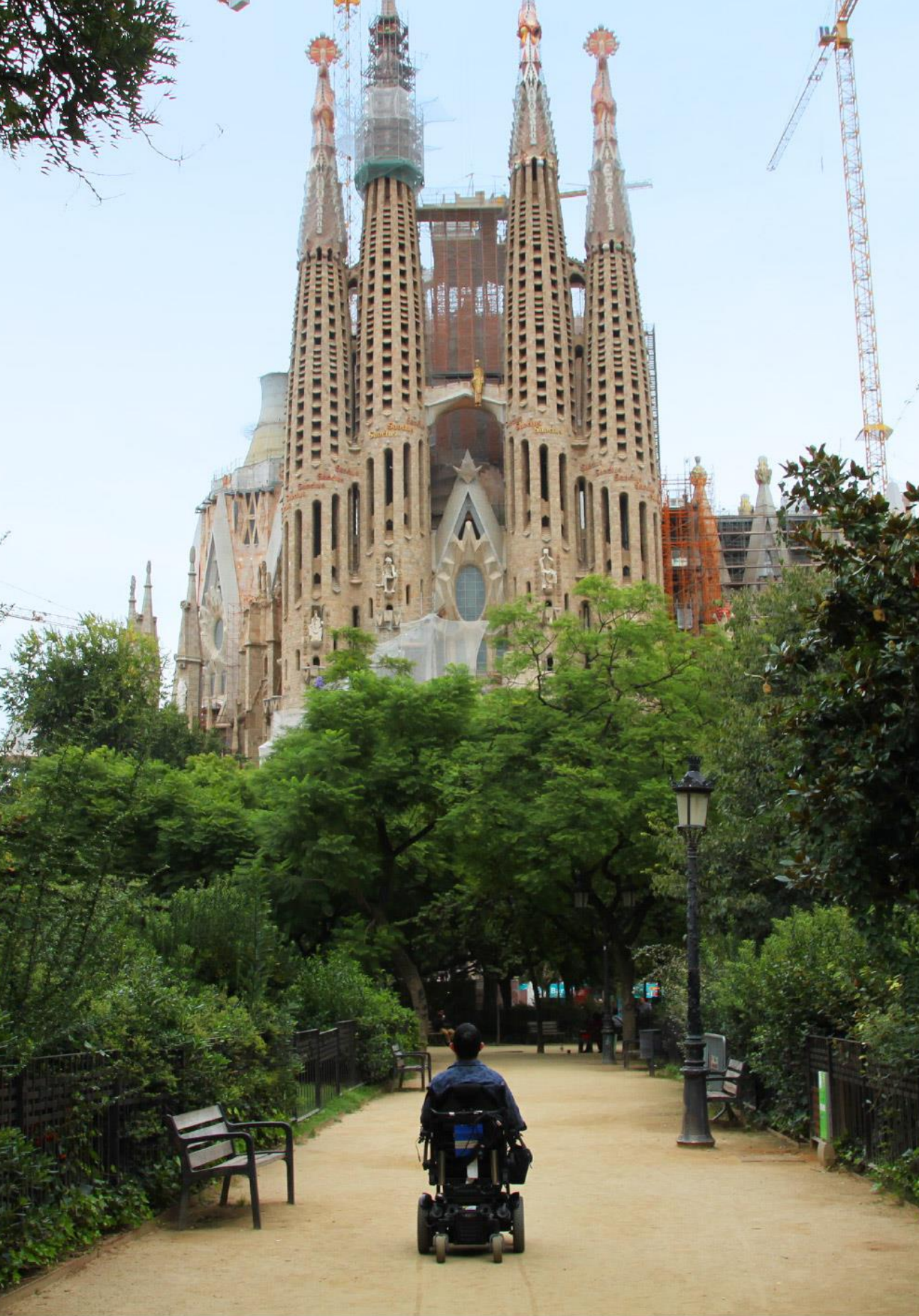
Basilica de la Sagrada Família, Barcelona