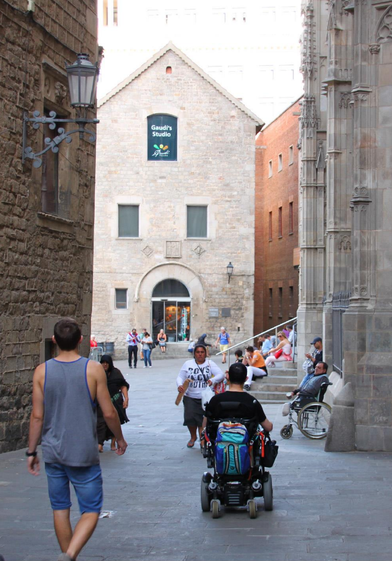
Catedral de Barcelona/Museu Diocesà, Barcelona