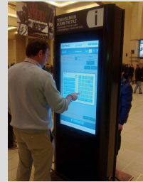
Tourism, travel and cultural information