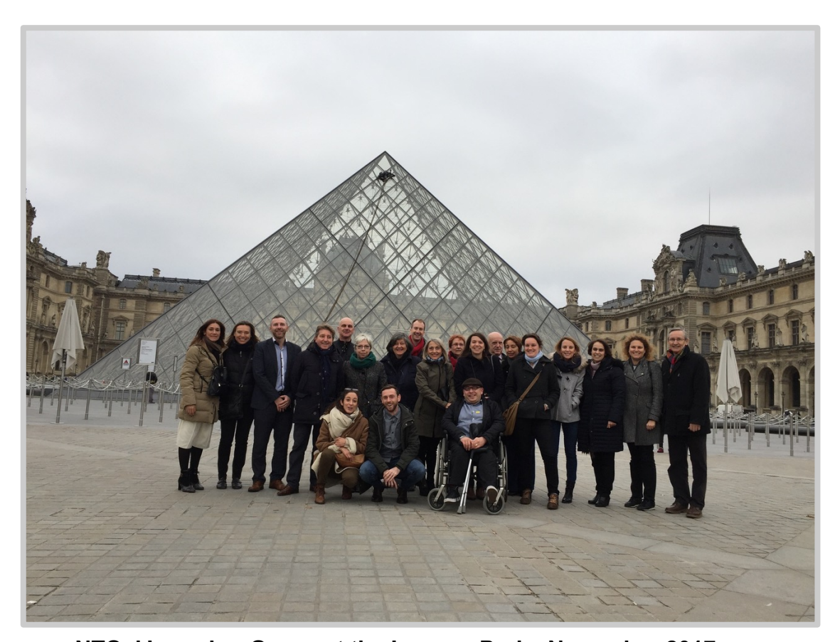
NTOs' Learning Group at the Louvre, Paris, November 2017