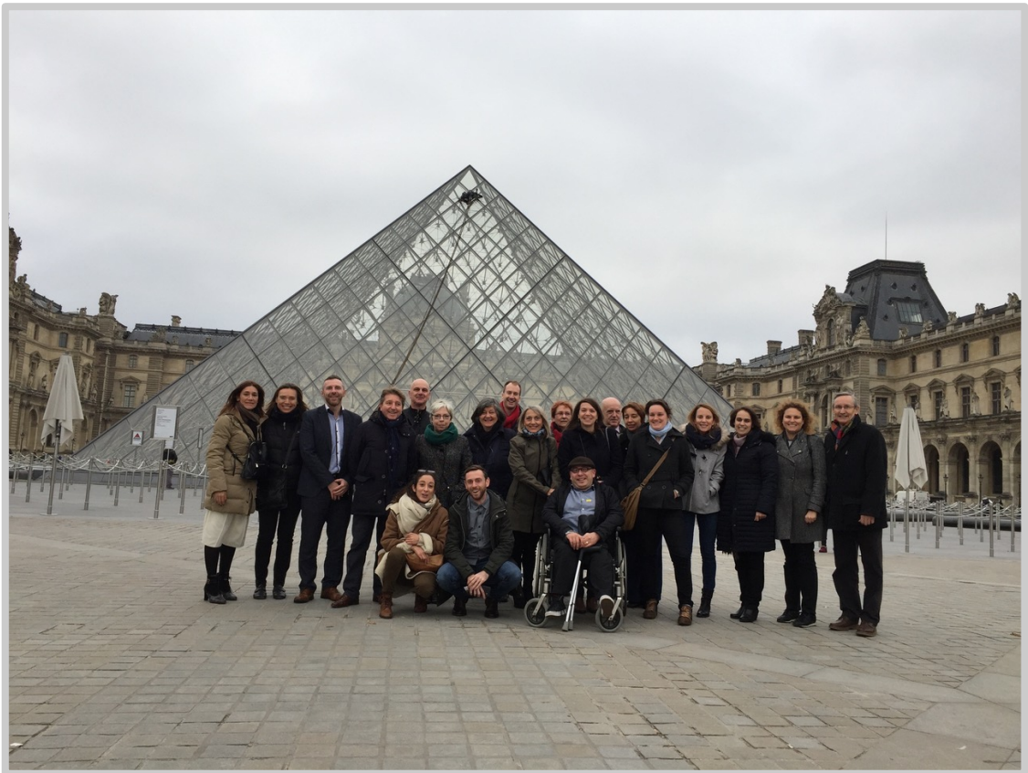
NTOs' Learning Group at the Louvre, Paris, November 2017

European Network for Accessible Tourism a.s.b.l.