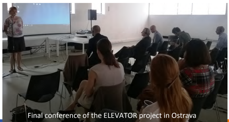
Final conference of the ELEVATOR project in Ostrava

There is also traditional part of the newsletter in this issue devoted to the sharing of experience and good practice, that was part of each partner meeting. This last "sharing" took place in the Czech R. (Ostrava, June 2018) during the final conference. Partners presented at the conference not only the findings of the project implementation, but also their long-term experience in the field of accessible tourism and examples of good practice from their countries.