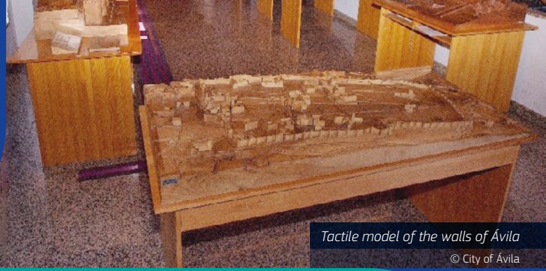
Tactile model of the walls of Ávila