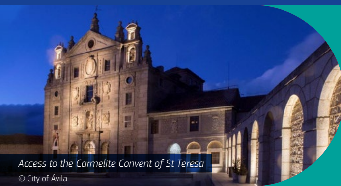
Access to the Carmelite Convent of St Teresa

The city has also analysed its offer to tourists with disabilities by gathering information on accessible itineraries, guided tours and other features, including information in alternative formats.