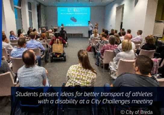
Students present ideas for better transport of athletes with a disability at a City Challenges meeting