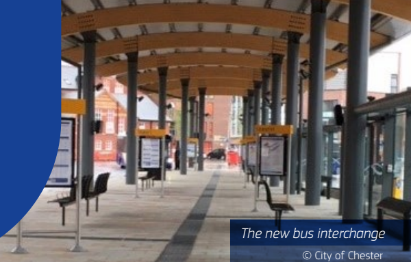
The new bus interchange