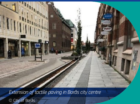
Extension of tactile paving in Borås city centre

Another key initiative has involved delivering training to persons with intellectual impairments to teach them about their rights.