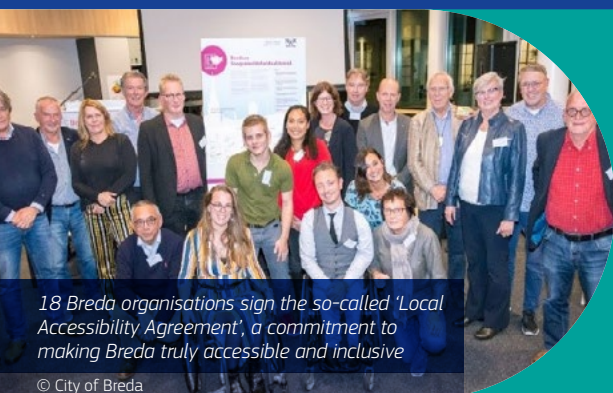
18 Breda organisations sign the so-called 'Local Accessibility Agreement', a commitment to making Breda truly accessible and inclusive

From 2019, Breda has committed to focus on accessibility and inclusiveness in every new municipal plan, supported by expert advisers with the title 'special officer accessible city'.