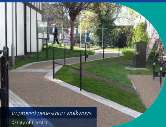
Improved pedestrian walkways

Public realm improvements have also benefitted wheelchair users, as well as guide dog owners and long cane users.