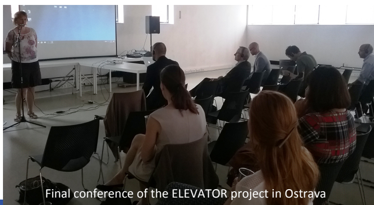
Final conference of the ELEVATOR project in Ostrava

There is also traditional part of the newsletter in this issue devoted to the sharing of experience and good practice, that was part of each partner meeting. This last "sharing" took place in the Czech R. (Ostrava, June 2018) during the final conference. Partners presented at the conference not only the findings of the project implementation, but also their long-term experience in the field of accessible tourism and examples of good practice from their countries.